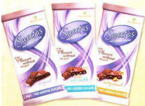
Sweet William's new Sweet As chocolate, $4.40, contains no added sugar and no artificial sweeteners, is low GI, diabetic friendly, cholesterol free, gluten free, dairy free and nut free. It won the 2010 confectionery division of the Food Challenge Awards, and is available in three flavours: original, rice crackle and nutty crunch (with roasted soy beans). Available from Big W, selected IGAs and health-food stores. For more information, visit www.sweetwilliam.com.au.