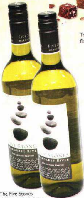
The Five Stones 2011 autumn harvest is a deliciously fruity white wine with flavours reminiscent of tropical fruits and citrus; it's a medium-sweet wine that goes well with spicy foods. Priced at around $18 a bottle, it is available from local retailers and direct from the winery (08) 9755 7402, sales@kosherwine.com.au.