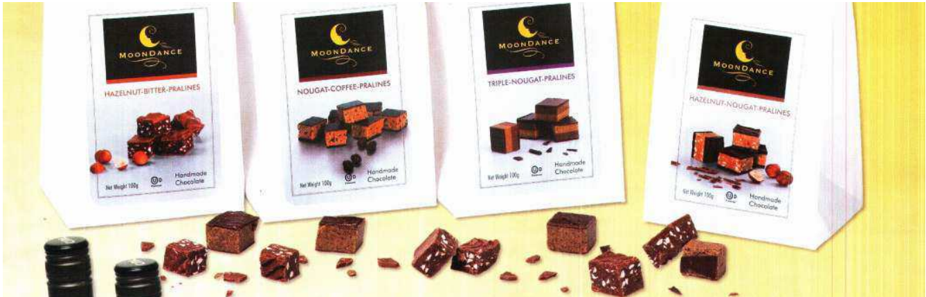
Triala Foods has recently launched its own brand of handmade gourmet chocolates, called Moondance. Available in four flavours, the chocolates are a unique gift item or special treat. Available from kosher outlets, Coles and Franks, $6.95.