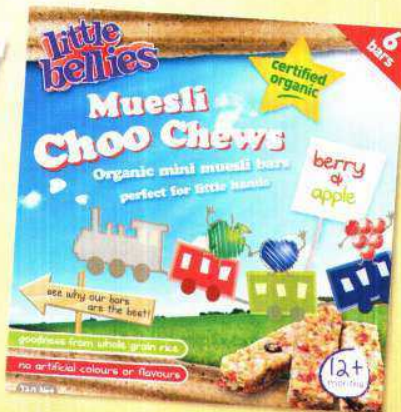
Little Bellies' organic muesli choo chews contain wholegrain brown rice, oats, dried apples and berries. They have no artificial colours, flavours or preservatives and are GMO free and low in sodium. Also available: fruity choo chews, made with 88 per cent real dried fruit and no added sugar. Available from Woolworths, selected supermarkets and health-food stores, $3.99.