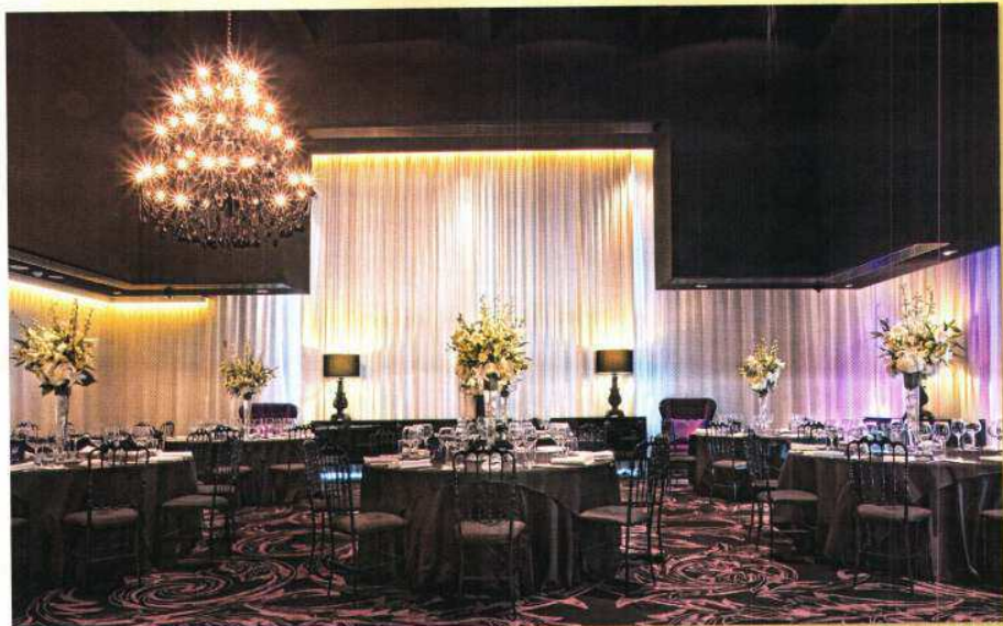
Atlantic Group [v] is at the forefront of high-end kosher catering, holding stylish and sophisticated events at Central Pier, Docklands or at a location that suits you. Atlantic Group [v] operates a new fleishig kitchen under the strict mehadrin supervision of Kosher Australia (03) 8623 9654, www.atlanticgroupv.com.au.